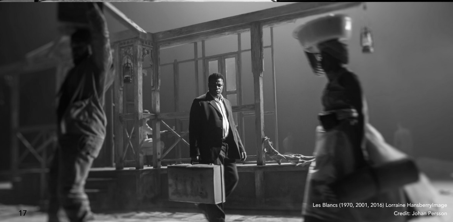
Les Blancs (1970, 2001, 2016) Lorraine Hansberry