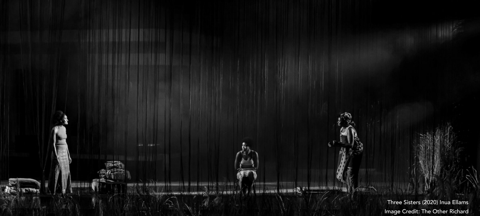
Three Sisters (2020) Inua Ellams