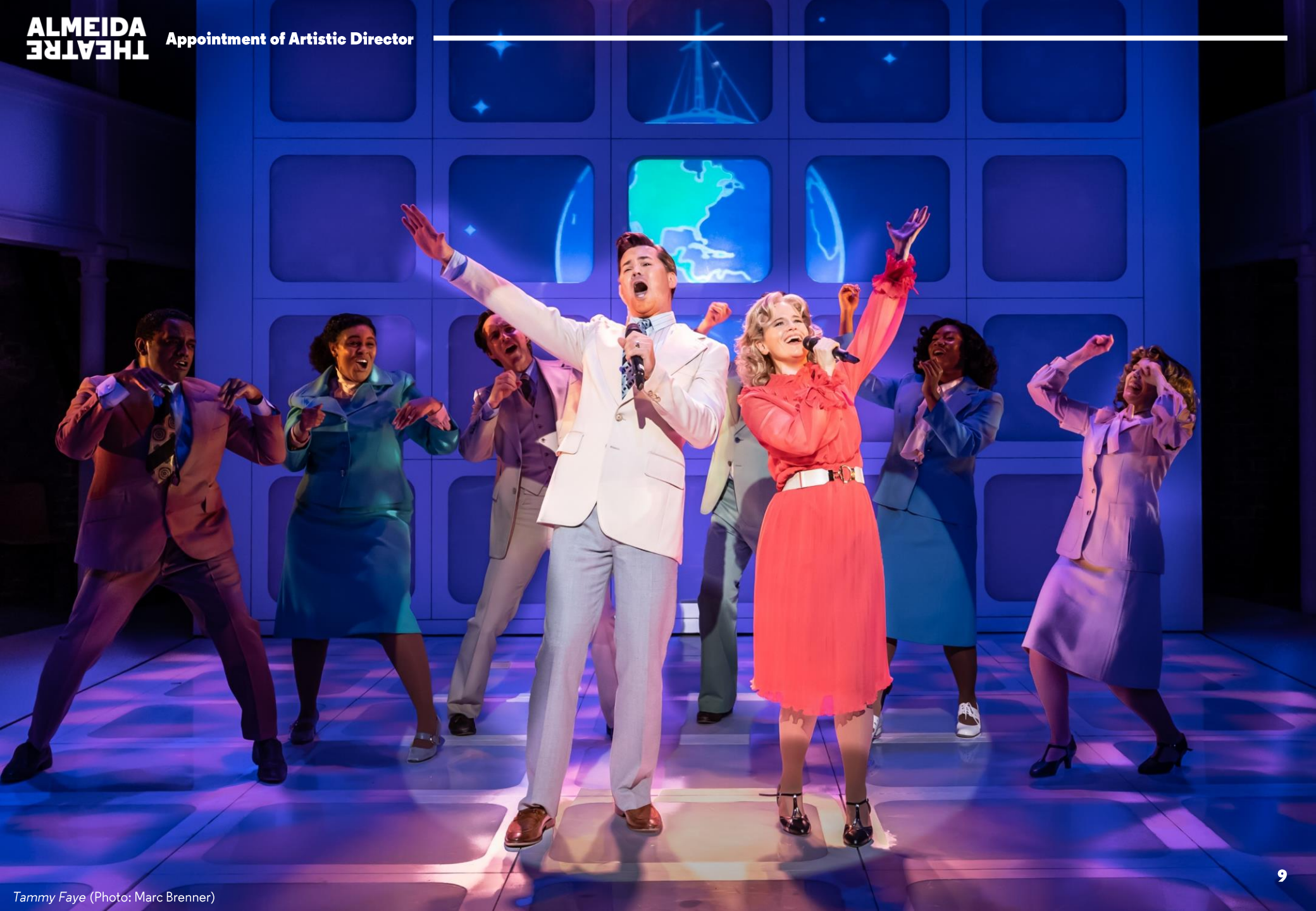
Tammy Faye