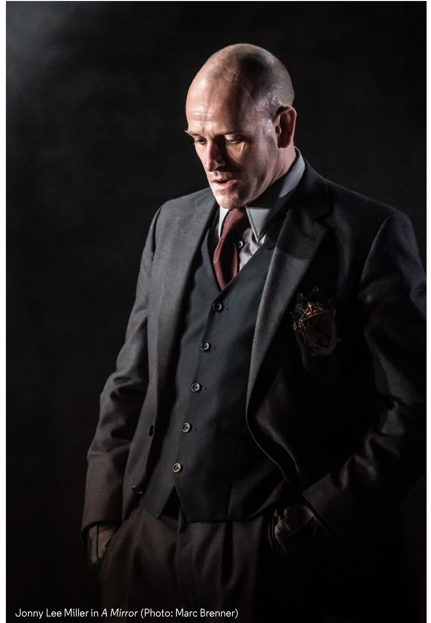
Jonny Lee Miller in A Mirror

Competitive salary dependent on experience.