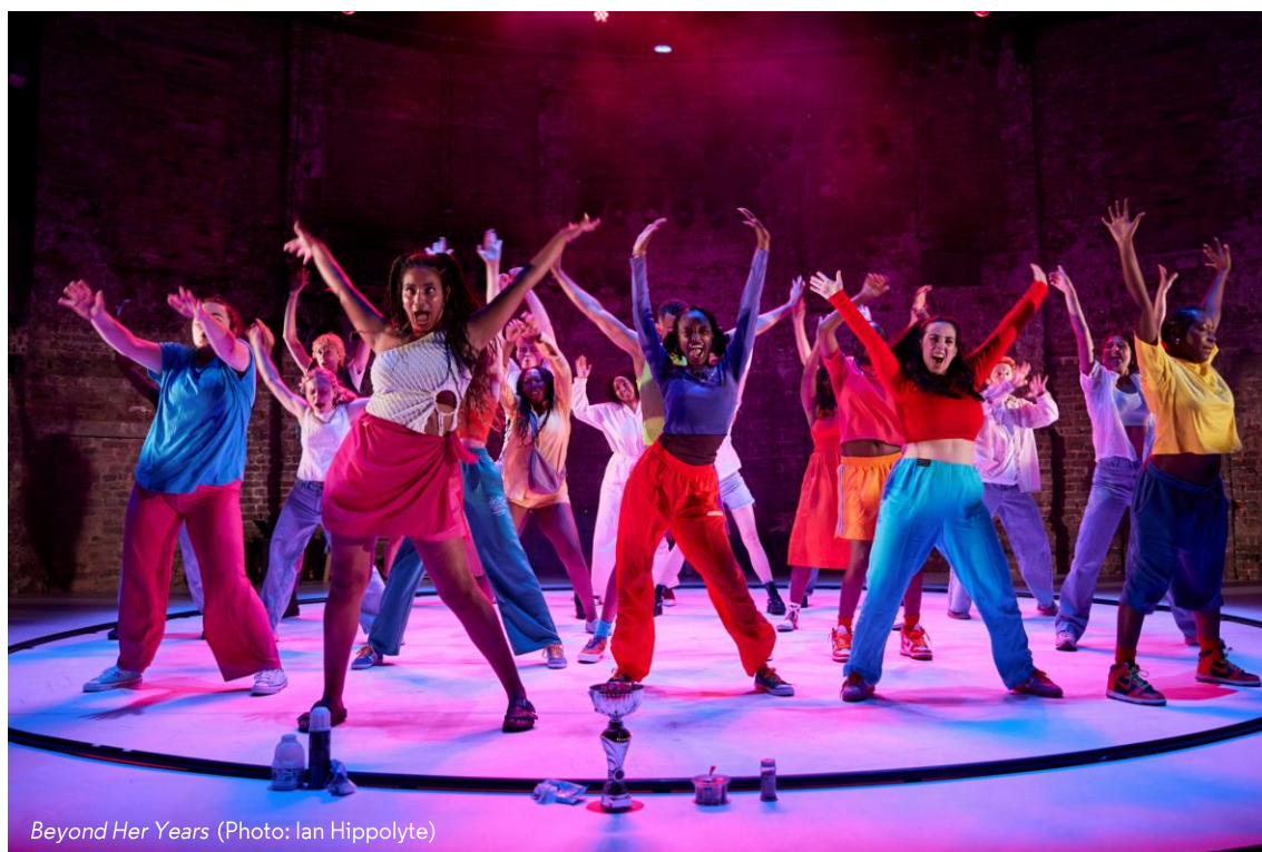
Beyond Her Years

In 2018, we set up a Youth Advisory Board, a group of young people aged 18-25 who are interested in arts leadership. They meet regularly as a group and are in dialogue with the senior management team and the Almeida Board. Currently they are focusing on data collection and how we tell stories about our participation programme; access work; and youth leadership. They continue to monitor our Actions for Change work and feed into the Board EDI Committee.