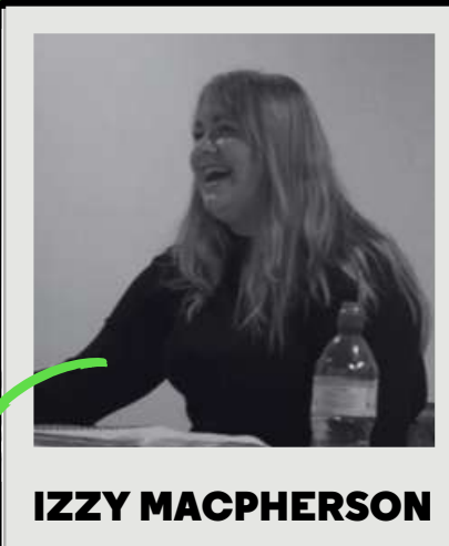
Izzy supported the curation of Cat on a Hot Tin Roof's For Free Festival