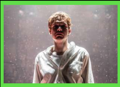
An Acting Masterclass with Billy Howle and Ellora Torchia

Unlike an average For Free, the Young Producers worked intensively with the Artistic Team to interrogate and elevate their event concepts, so they truly reflected the high quality of the Almeida. As a result, the 10 events were ambitious, multi-disciplinary and acutely socially relevant .