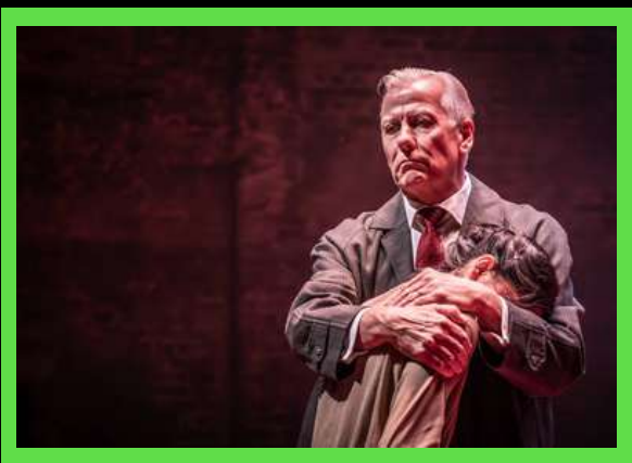
Public Studio: On Class and Culture a debate on the relationship between class and cultural capital led by the Almeida Youth Board